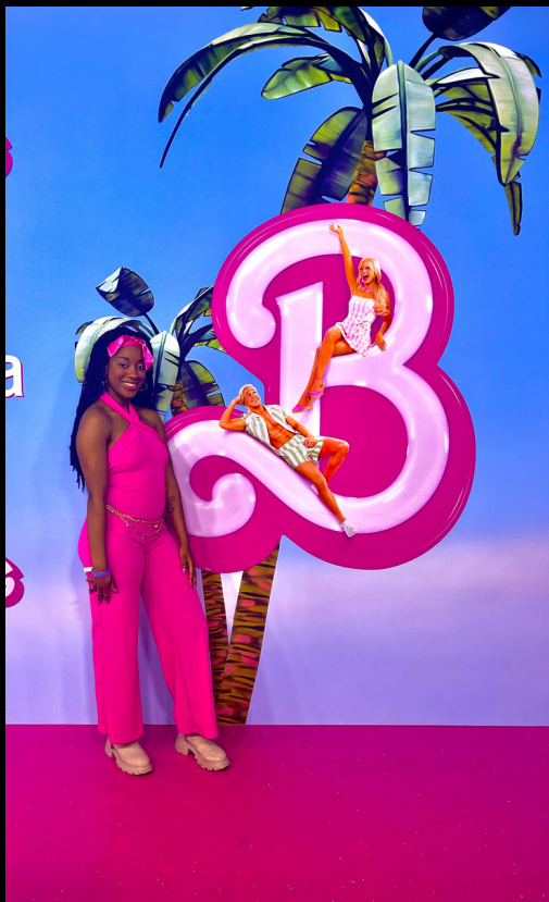
Barbie Toronto Warner Brothers Event