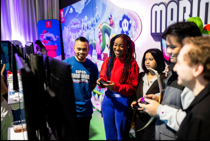
Super Mario Bros Wonder Preview Event