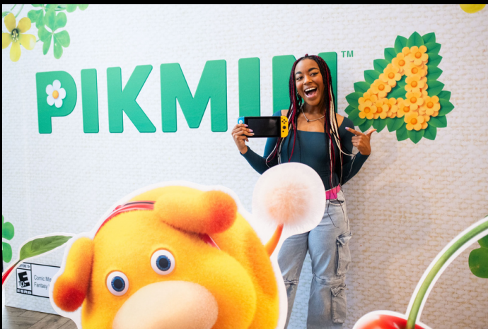
Nintendo Pikmin 4 Event