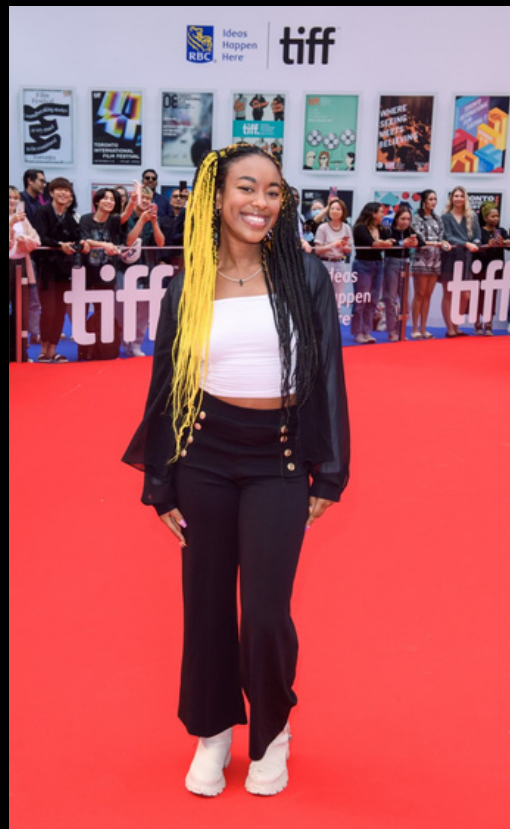
TIFF Toronto 2023 Red Carpet