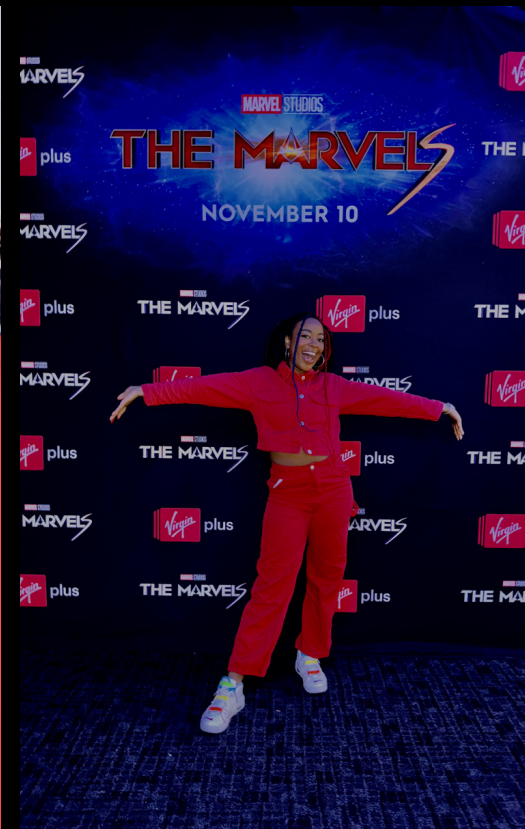
Disney's The Marvels Advance Screening