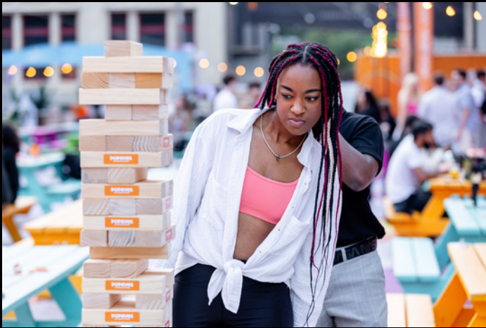
TD Union Summer Influencer Campaign