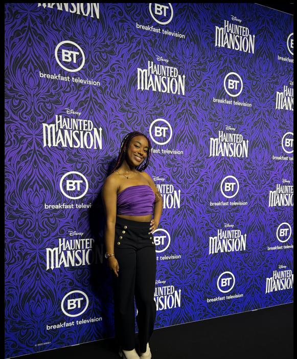
Disney's Haunted Mansion Advance Screening Event